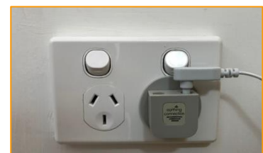
Plug adaptor into wall socket or power board