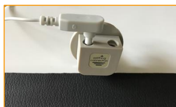
Adaptor plug with built-in splitter